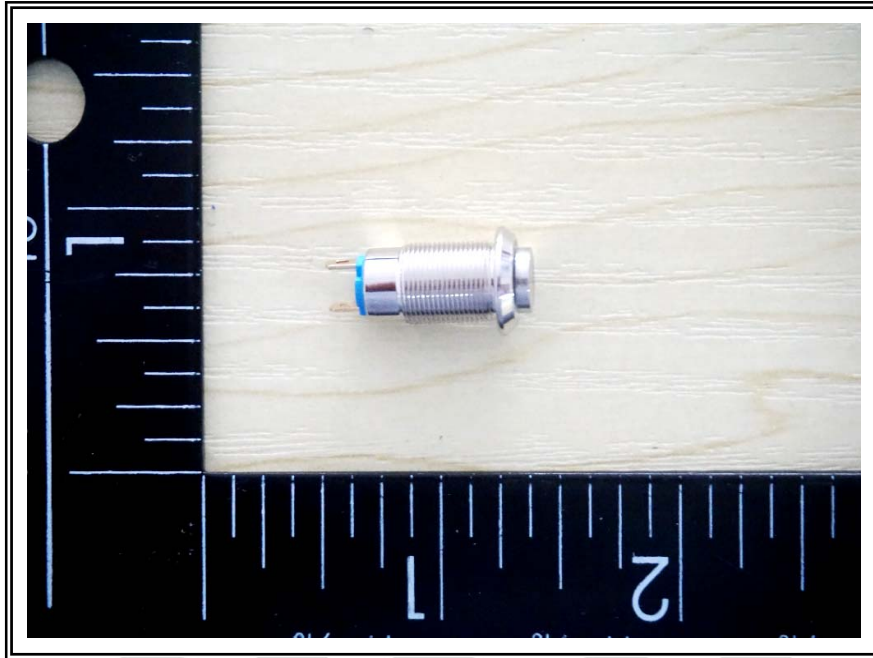
Test item: PUSH BUTTON SWITCH